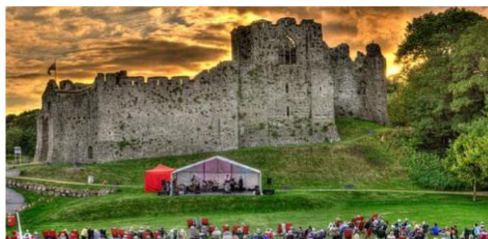
Outdoor theatre at Oystermouth Castle, Mumbles

There are many other activities and events that can help you to enjoy your leisure time: