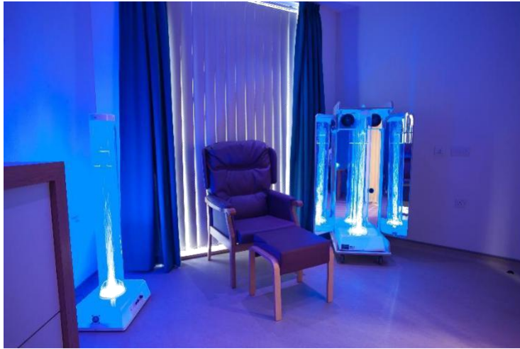
Blue room (above)