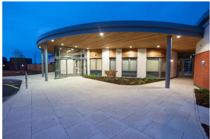
Ysbryd Y Coed (above)