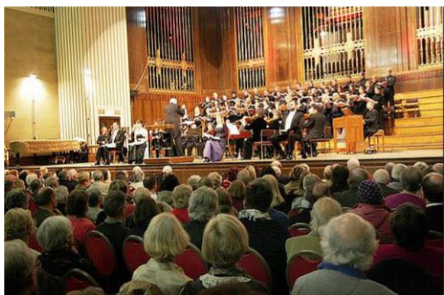
Messiah at the Brangwyn Hall, Swansea

Swansea hosts a Festival of Music and the Arts, when international orchestras and soloists visit the Brangwyn Hall. The Brangwyn Hall is praised for its acoustics for recitals, orchestral pieces and chamber music alike. Throughout the region there are annual festivals in its’ many Art Centres and Theatres.