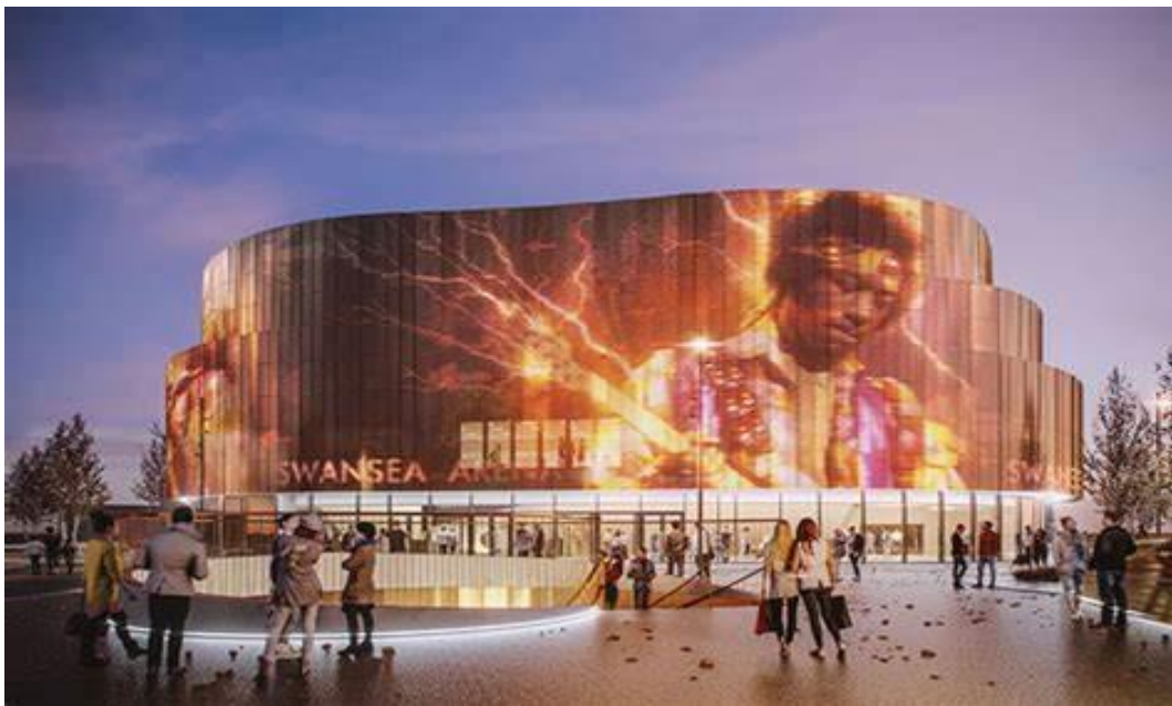
Artists' impression of the exciting new 3,500 capacity Swansea Arena currently under construction, due to open in 2022.