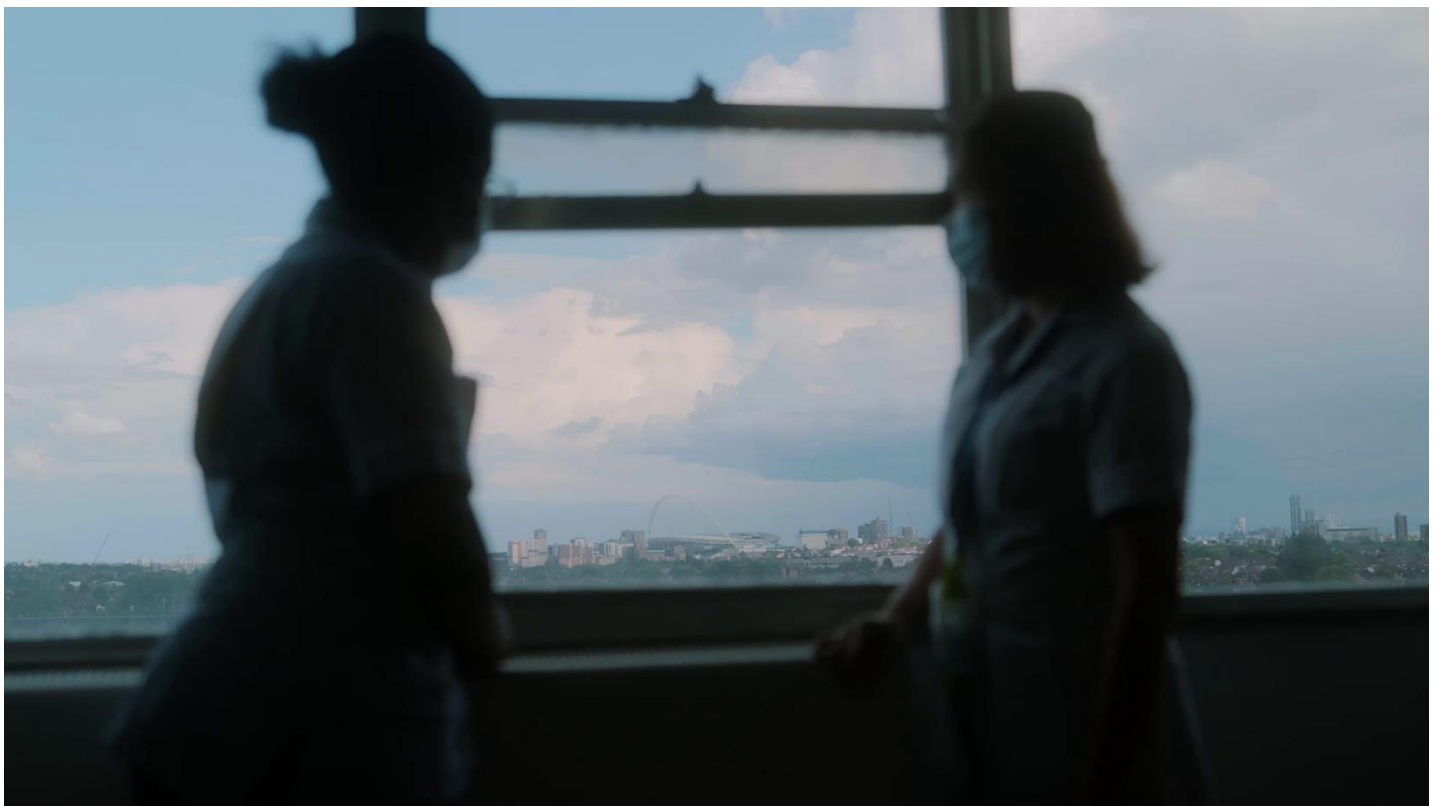
From the ward block, you can see Wembley Stadium

With Wembley Stadium to the south east and the rolling Harrow on the Hill countryside to the west, our ward block offers unparalleled views of the area. On a clear day, you can even see all the way into the city and beyond.